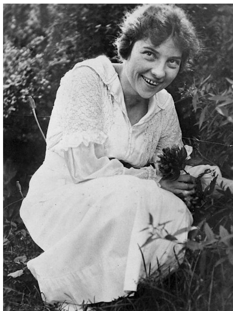
Figure 2: Elizebeth Smith at Riverbank (source: National Cryptologic Museum Library).

run there. Being the few really young people on the place, they got bicycles and would ride around the countryside, and they became friends very shortly. A picture of her, probably taken by William Friedman, is Figure 2.