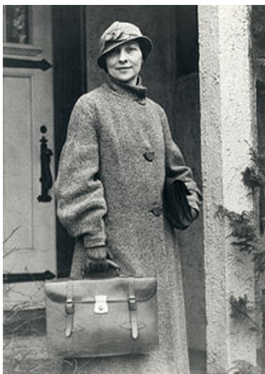
Figure 6: Elizebeth Smith Friedman with briefcase.

important case could have been won. Mrs. Friedman made an unusual impression upon the jury. Her descriptions of the art of deciphering and decoding established in the minds of all her entire competency to testify. It would have been a misfortune of the first magnitude in the prosecution of this case not to have had a witness of Mrs. Friedman's qualifications and personality available.